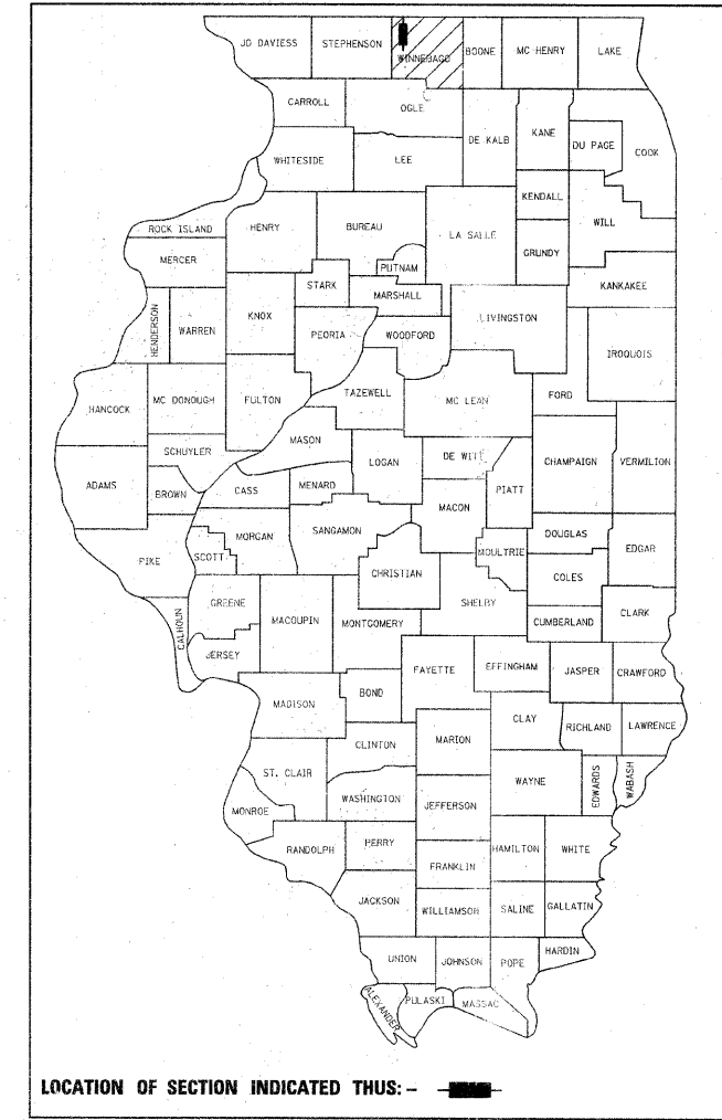
LOCATION OF SECTION INDICATED THUS: - [shaded area] -