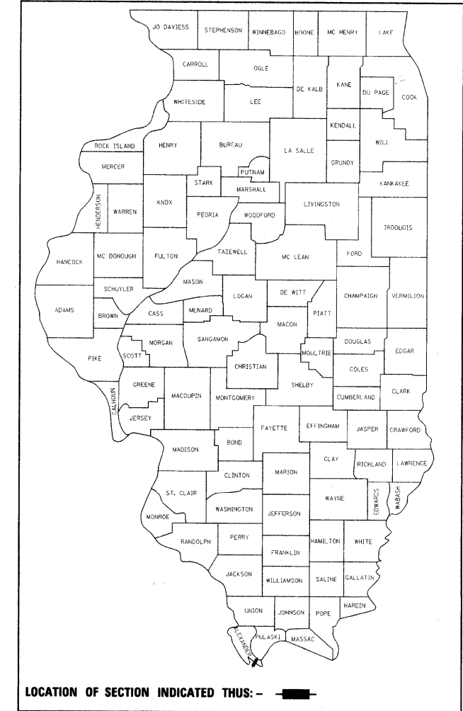
LOCATION OF SECTION INDICATED THUS: - [shaded box] -

FOR INDEX OF SHEETS, SEE SHEET NO. 2 FOR SUMMARY OF QUANTITIES, SEE SHEET NO. 3