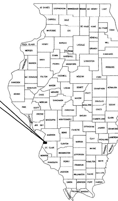
ST. CLAIR COUNTY LOCATION OF SECTION INDICATED THUS -