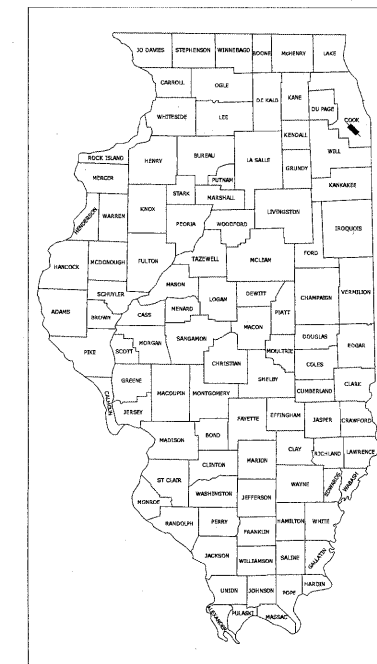
LOCATION OF SECTION INDICATED THIS:

PROJECT ENDS STATION 28+75 GRAND BOULEVARD