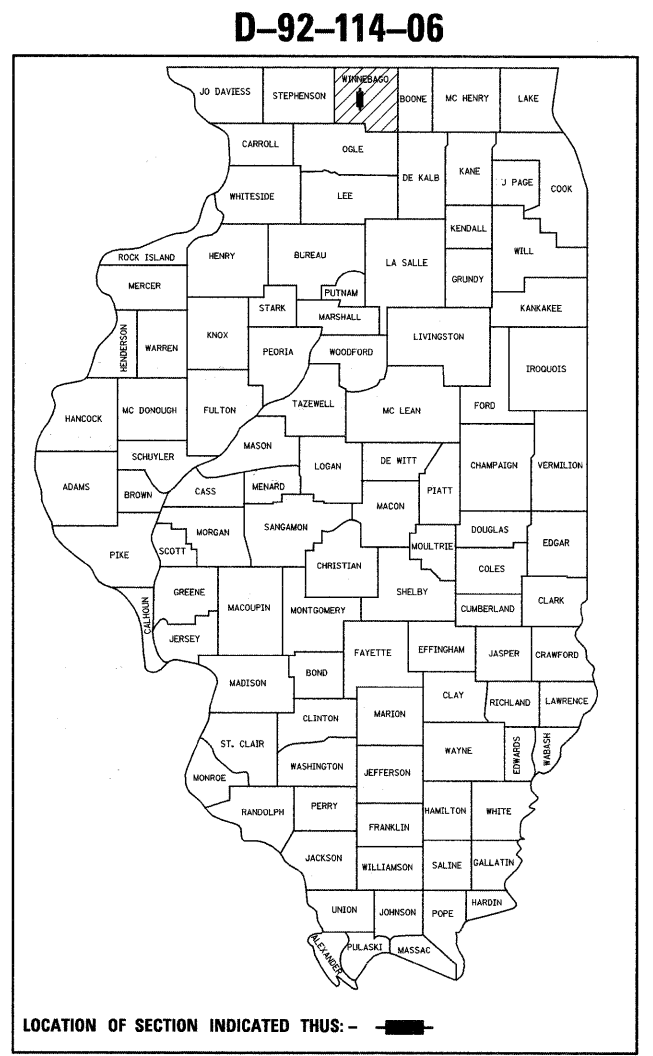
LOCATION OF SECTION INDICATED THIS: - [shaded rectangle]

GROSS LENGTH OF PROJECT = 4535.02 FEET = 0.86 MILE NET LENGTH OF PROJECT = 4535.02 FEET = 0.86 MILE