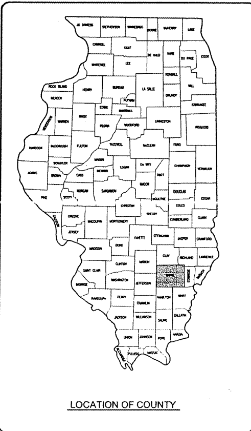
LOCATION OF COUNTY