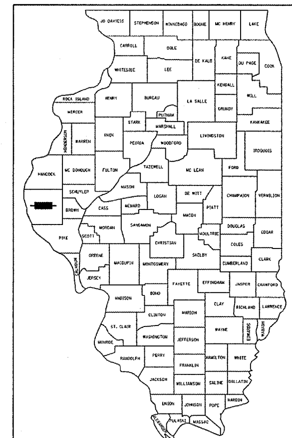
LOCATION OF SECTION INDICATED THUS: - ■ -