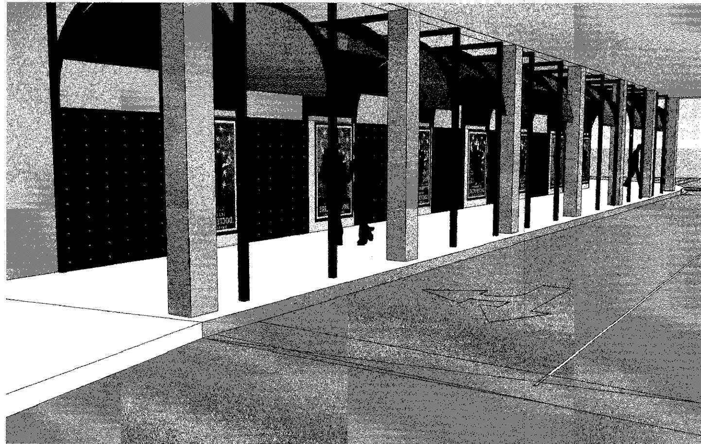
MARION STREET VIADUCT ARCHITECTURAL RENDERINGS OF ORNAMENTAL METAL PANELS (FOR INFORMATION ONLY)