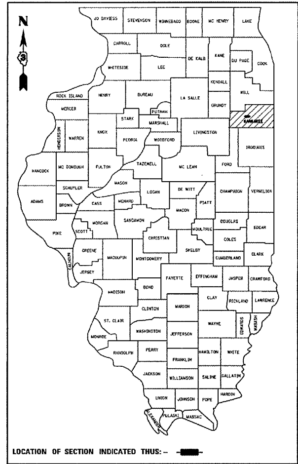
LOCATION OF SECTION INDICATED THUS: - [shaded box] -