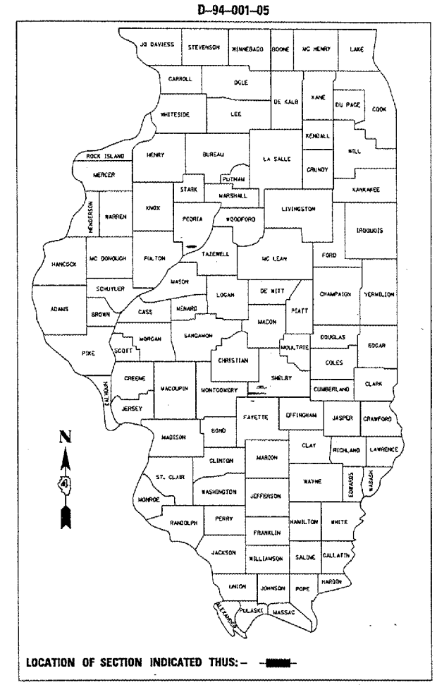
LOCATION OF SECTION INDICATED THUS: ———

PROJECT CONSISTS OF REMOVAL AND REPLACEMENT OF 3 JOINTS, WATERPROOFING MEMBRANE, AND BITUMINOUS WEARING SURFACE ON STRUCTURE S.N. 072-0135 AT STA.411+32.88 CARRYING US 24 & IL 9 S.B. OVER T.P.& W. RR. & WHEELER RD. 1 MILE EAST OF MAPLETON.