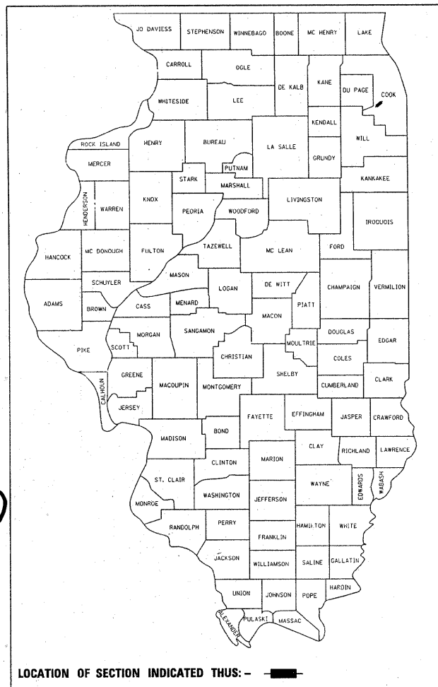
LOCATION OF SECTION INDICATED THUS: —