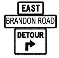
TYPICAL SIGN ASSEMBLY