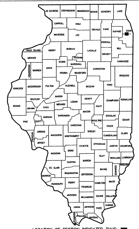
LOCATION OF SECTION INDICATED THUS: [Symbol]

CENTRAL AVE. (FAU 2798) 26TH ST. (FAU 1459) TO ROOSEVELT RD. (FAP 347) RESURFACING PROJECT M-9003(488) SECTION 03-00193-00-FP TOWN OF CICERO COOK COUNTY C-91-076-10 PROJECT LOCATION MAP