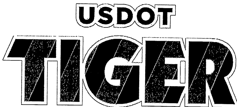
USDOT TIGER Vector-Based, Vinyl-Ready Pictograph

COLORS: OUTLINE - WHITE (RETROREFLECTIVE) USDOT LEGEND - BLACK TIGER DIAGONALS - BLACK, ORANGE (RETROREFLECTIVE)