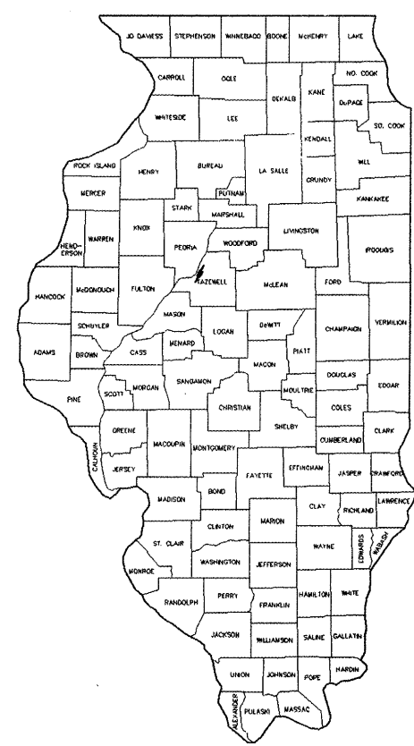
LOCATION OF PROPOSED IMPROVEMENT

COUNTY OF TAZEWELL, ILLINOIS FEDERAL PROJECT NO. SRTS-4008(002) SECTION NO. 08-00024-00-SW JOB NO. C-40-030-08