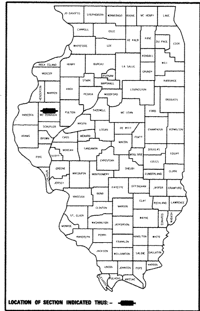
LOCATION OF SECTION INDICATED THUS: - [black rectangle] -