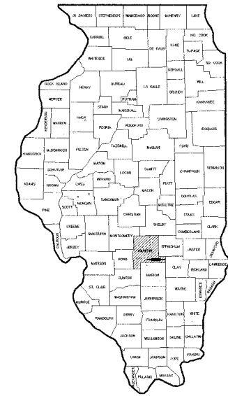
LOCATION OF PROJECT INDICATED THUS - - -