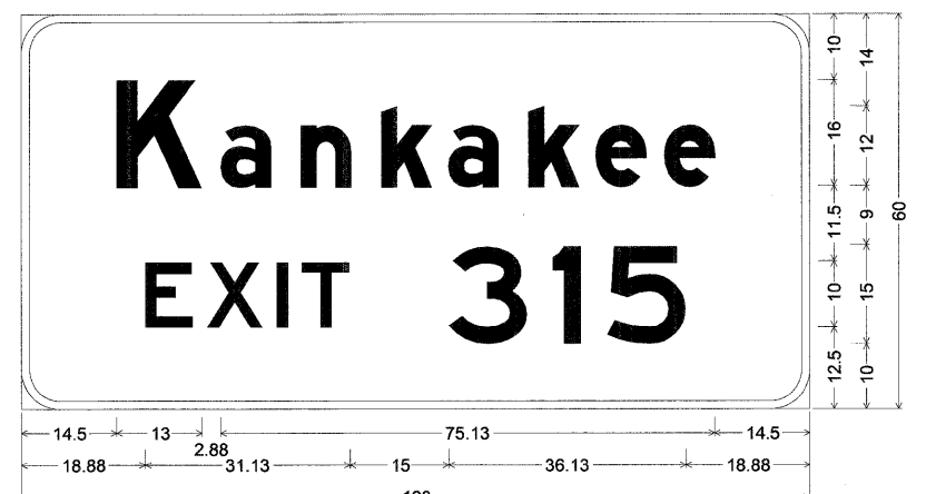
EXIT RAMP GUIDE SIGN (GROUND MOUNT) STA 26+00, 31.0' RT (RAMP E) CLEARVIEW 5 W FONT SHOULD BE USE IN PLACE OF E MOD FONT