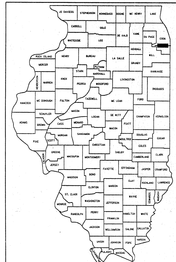
LOCATION OF SECTION INDICATED THIS: - [black rectangle] -