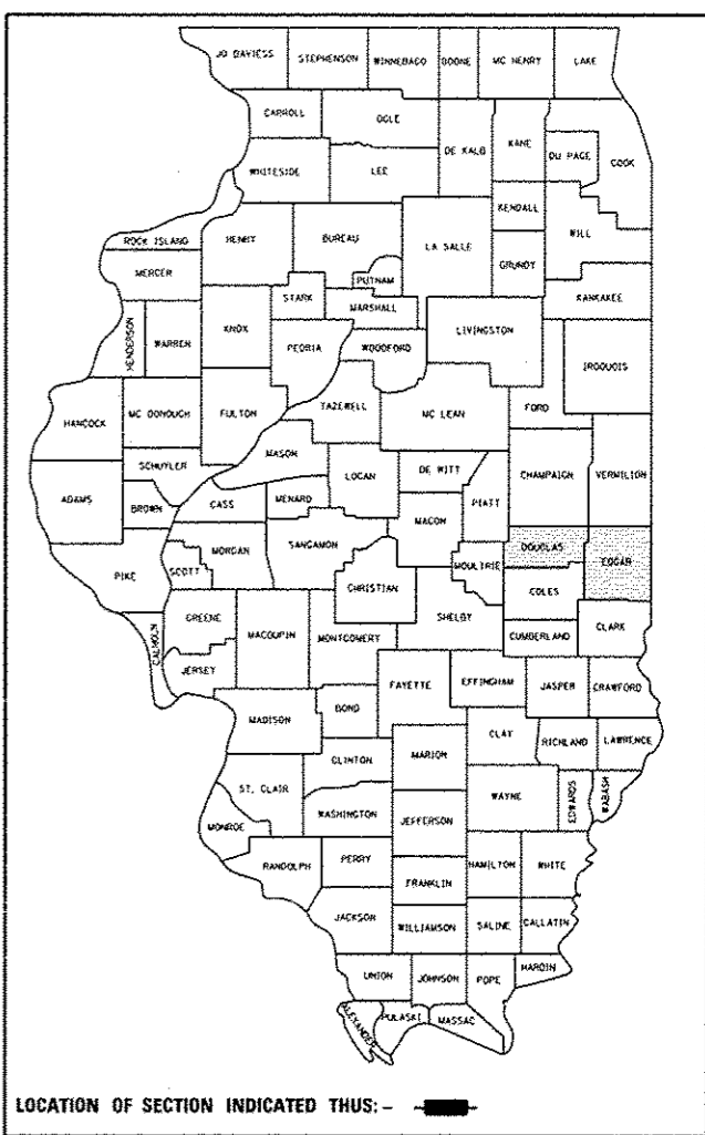
LOCATION OF SECTION INDICATED THUS: - [shaded area]

FOR INDEX OF SHEETS, SEE SHEET NO. 2 FOR SUMMARY OF QUANTITIES, SEE SHEET NO. 6