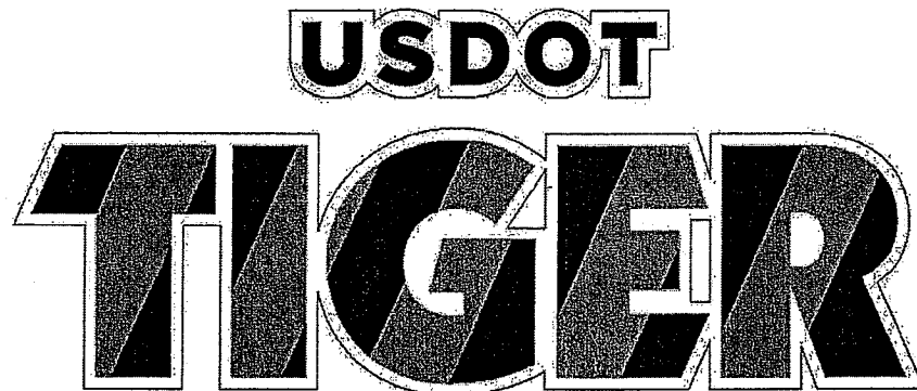
USDOT TIGER Vector-Based, Vinyl-Ready Pictograph

COLORS: OUTLINE - WHITE (RETROREFLECTIVE) USDOT LEGEND - BLACK TIGER DIAGONALS - BLACK, ORANGE (RETROREFLECTIVE)