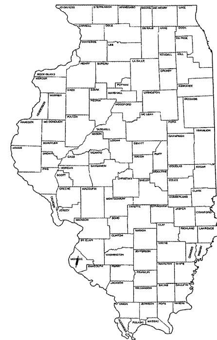
LOCATION OF SECTION INDICATED THIS: