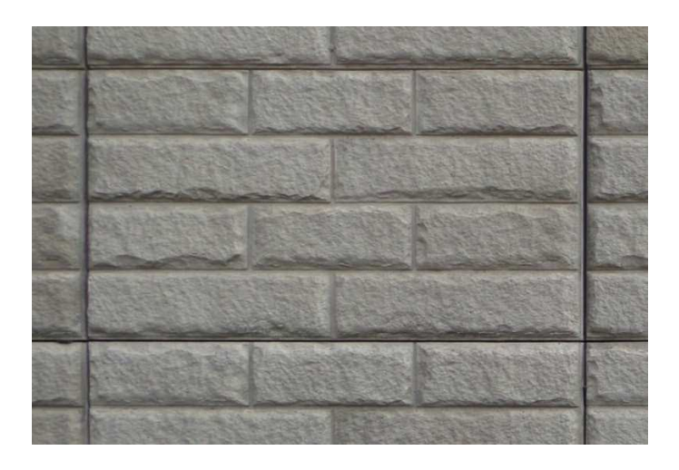
Exhibit C- Gravity Type Precast concrete Units Pattern

The desired form liner pattern appearance is to be as shown below. The relief shall be approximately 1 1/2" average and no greater than 2 ½" maximum. A pattern "Exhibit C" is provided below, illustrating the appearance desired.