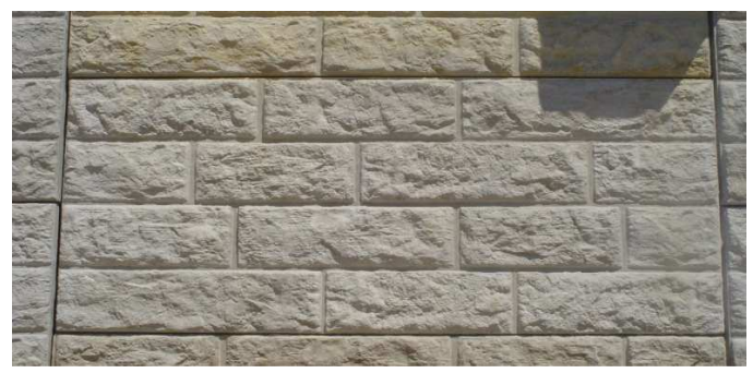
Exhibit B- Precast Concrete Panels Pattern

The relief shall be approximately 1 ½" average and no greater than 2 ½" maximum. A pattern "Exhibit B" is provided below, illustrating the appearance desired.