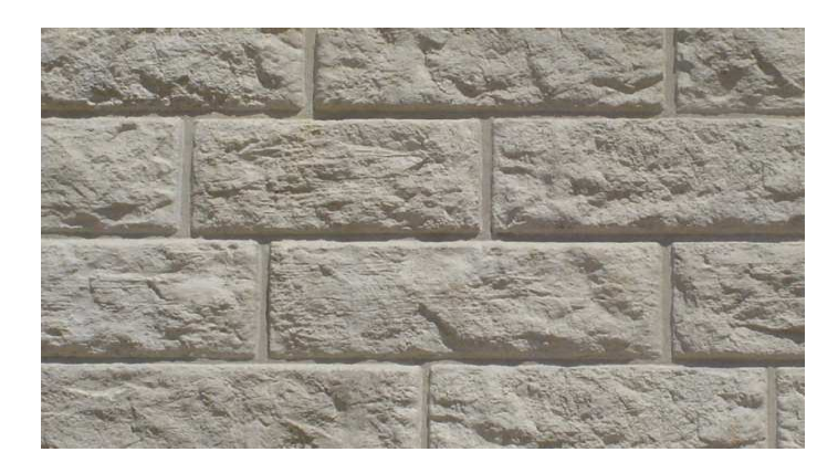
Exhibit A- Cast-in place Pattern

The relief shall be approximately 1 ½" average and no greater than 2 ½" maximum. A pattern "Exhibit A" is provided below, illustrating the appearance desired.