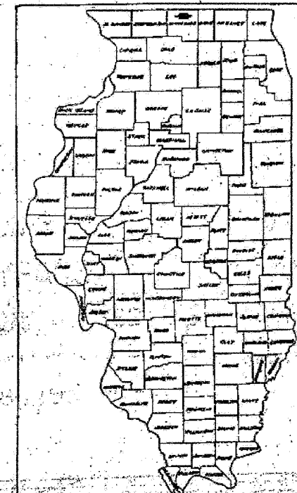
LOCATION OF SECTION INDICATED THUS: [Symbol]

SECTION 3HB-2 CONSISTS OF THE CONSTRUCTION OF TWO (2) WY BEAM GRADE SEPARATION BRIDGES (ROCKFORD BYPASS OVER ROUTE 51) SPANS: 1 @ 43' - 10", 1 @ 73' - 3", 1 @ 73' - 3" AND 1 @ 43' - 10", AT STATION 55+15.5 AT THE INTERSECTION OF THE ROCKFORD BYPASS AND ROUTE 51 WITH THE EXCEPTION OF FURNISHING AND FABRICATING THE STRUCTURAL STEEL, FURNISHING AND APPLYING ONE (1) SHOP COAT OF PAINT AND THE DELIVERY OF THE STRUCTURAL STEEL TO THE SITE.