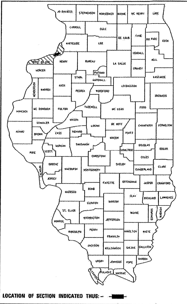
LOCATION OF SECTION INDICATED THUS: —