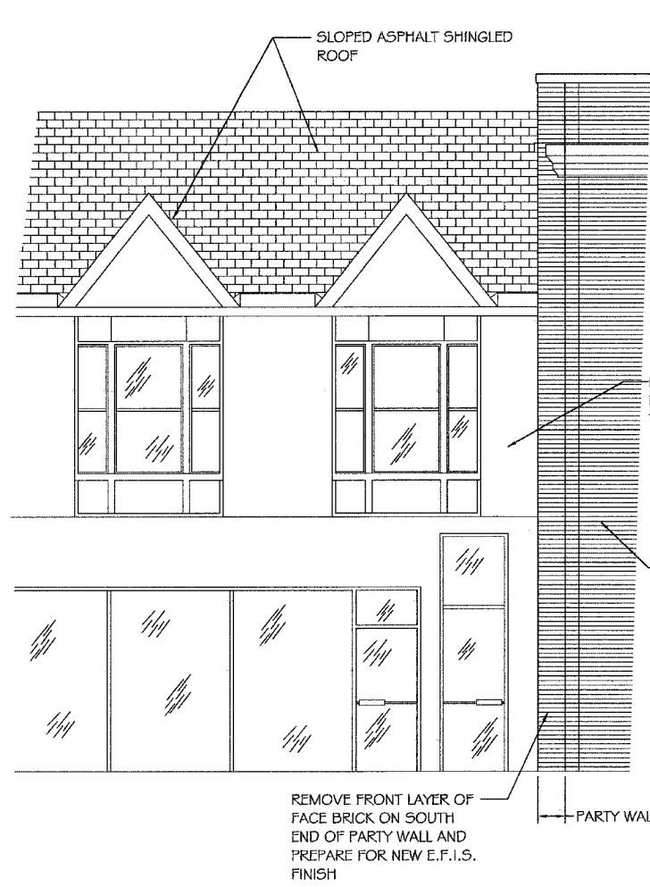
EXISTING SOUTH BUILDING ELEVATION NOT TO SCALE