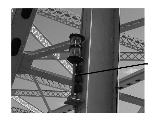
EXISTING NAVIGATION LIGHT (TYPICAL)

Replace Each White Navigation Light Assembly with LED Navigation Light Assemblies (see Construction Sequence on Sheet S12)