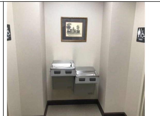
Description: Hallway sinks