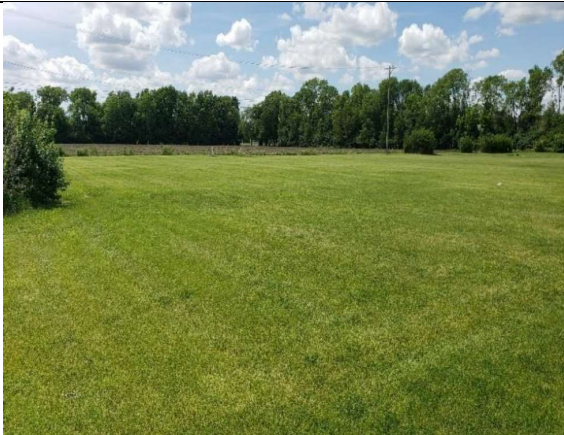
Description: Additional land behind improvement