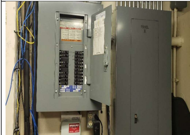
Description: Electrical boxes in maintenance room