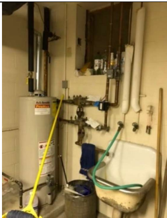
Description: Janitor sink in maintenance room