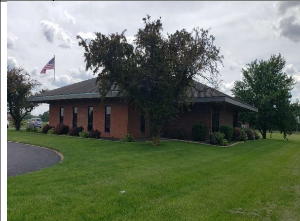
Description: View of subject property, facing Southwest