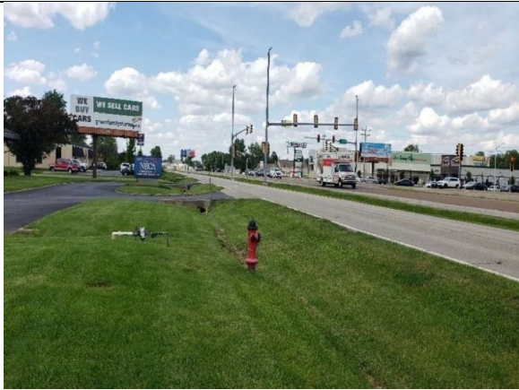
Description: View of 6 th Street frontage road and project area facing North