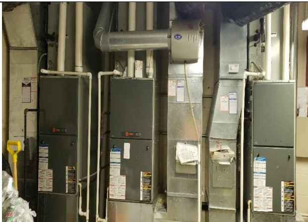
Description: HVAC systems in maintenance room