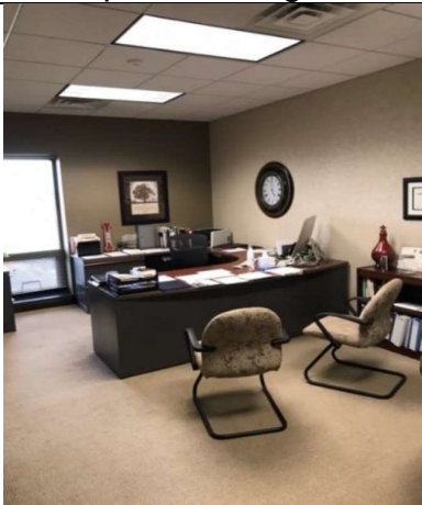
Description: Main office