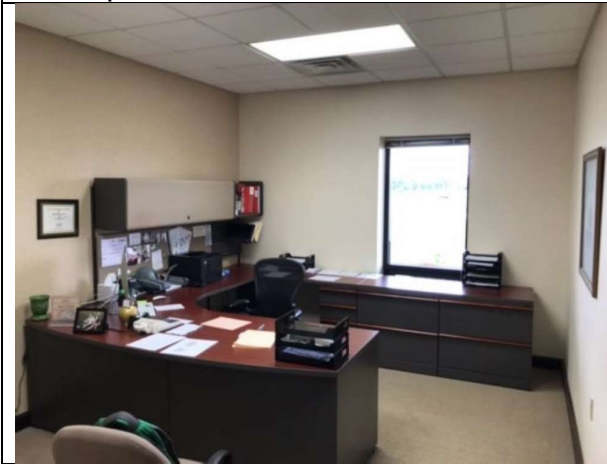
Description: Typical Office Layout