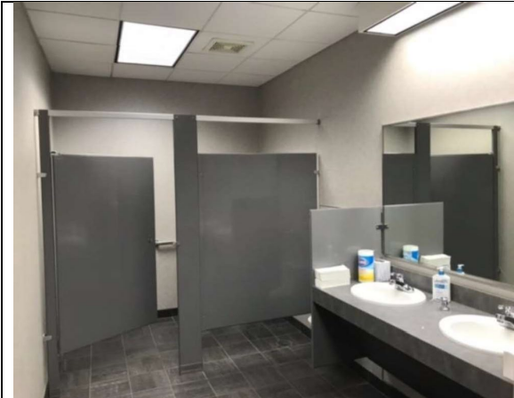
Description: 2 nd Bathroom