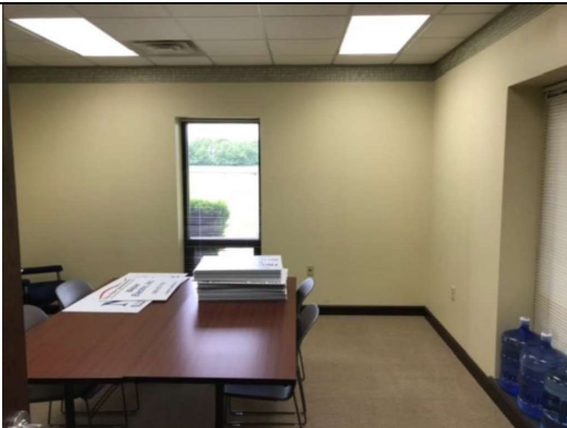
Description: Large conference room