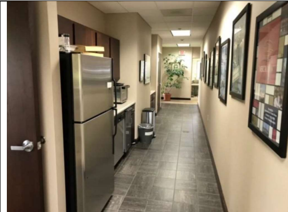
Description: Kitchenette/Break area