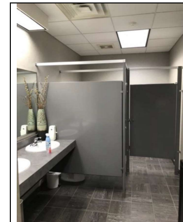
Description: 1 st Bathroom