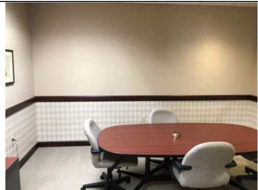
Description: Small conference room