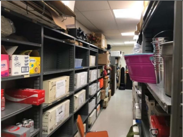
Description: Storage room/File room