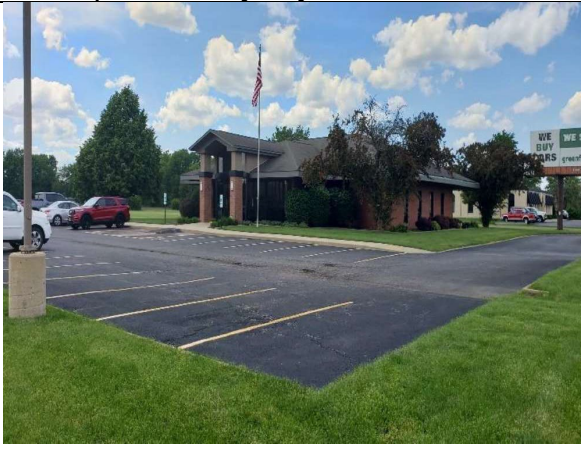
Description: View of subject property, facing Northwest