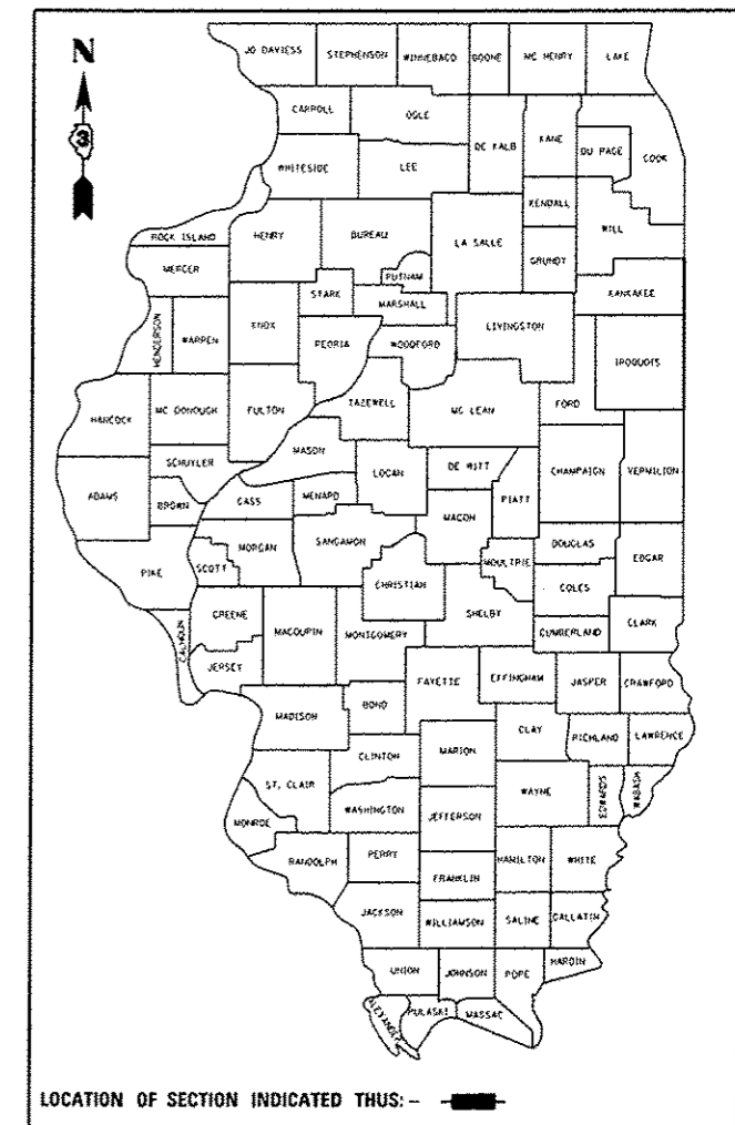
LOCATION OF SECTION INDICATED THUS: - [black rectangle] -