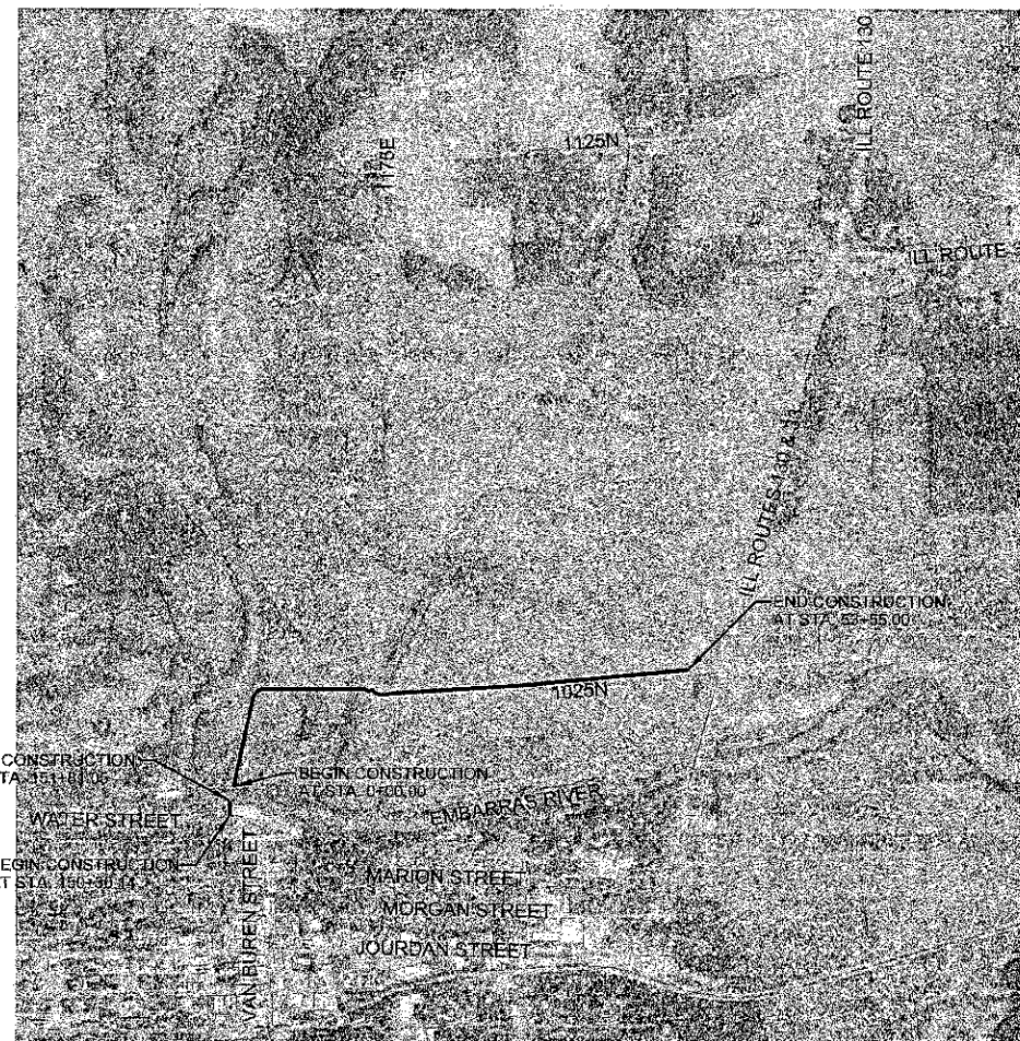
LOCATION MAP CITY OF NEWTON

LENGTH OF PROJECT EAGLE TRAIL = 5505.91 Feet (1.04 Mile)