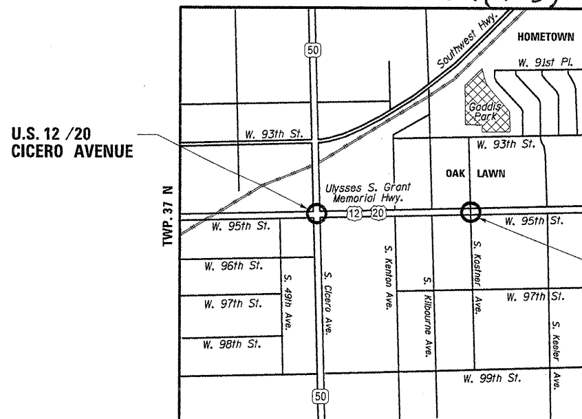
R. 13 E LOCATION MAP