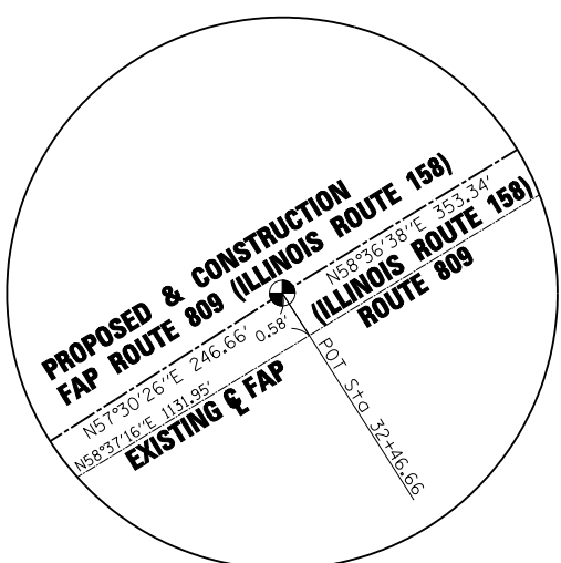
DETAIL D NOT TO SCALE