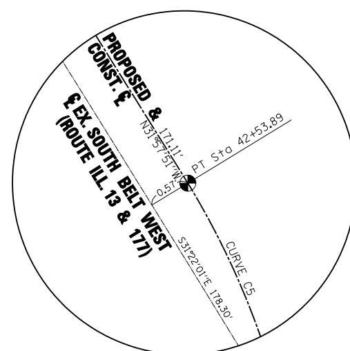
DETAIL B NOT TO SCALE