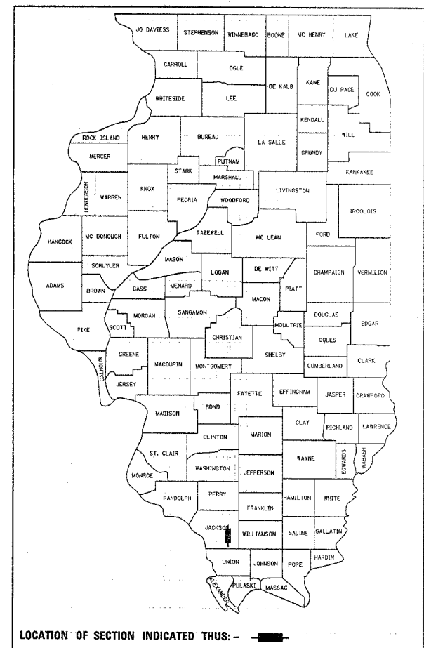
LOCATION OF SECTION INDICATED THUS: - [rectangle] -

FOR INDEX OF SHEETS, SEE SHEET NO. 2 OF 8