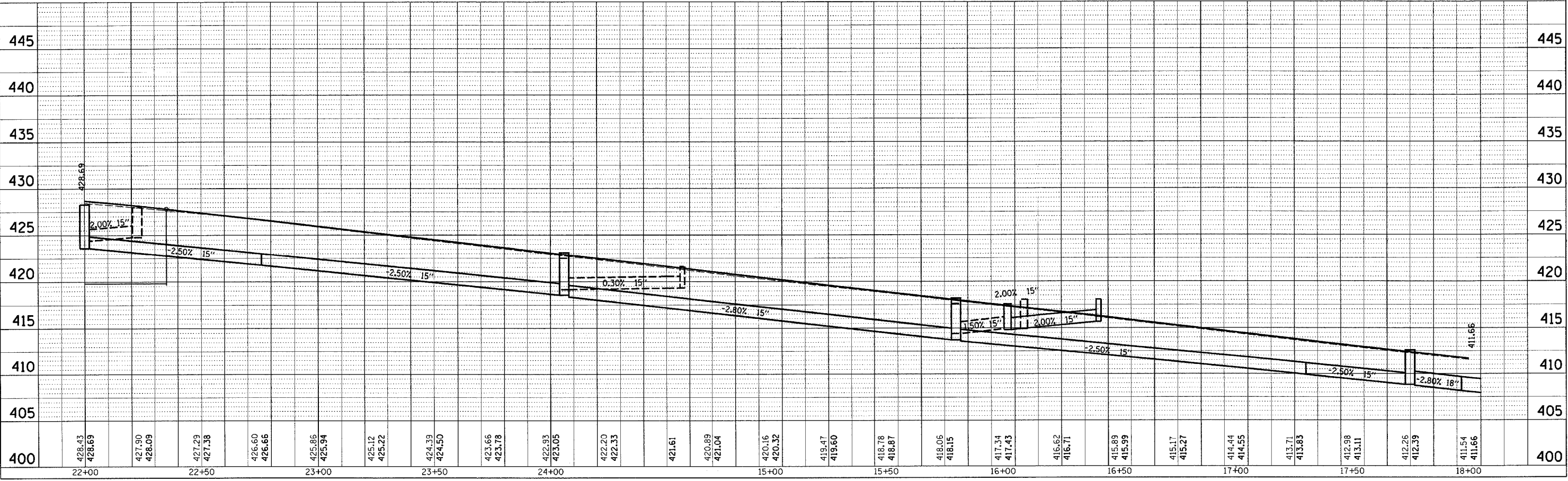
STATION 22+00 TO STATION 18+00