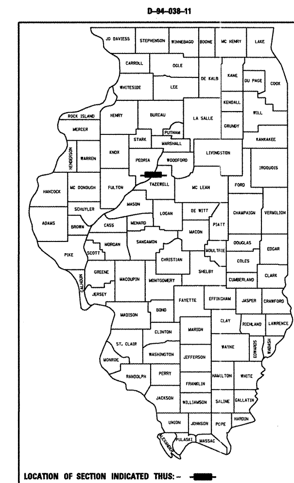
LOCATION OF SECTION INDICATED THIS: - [black bar]