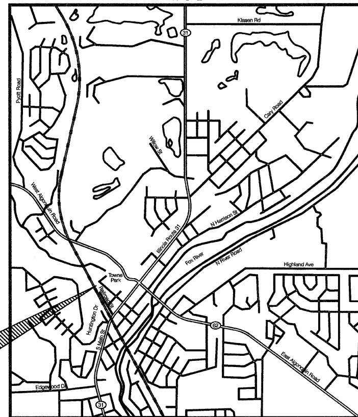
LOCATION MAP R 8 E