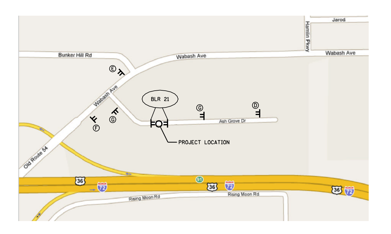
ROAD CLOSED SIGNING LOCATIONS - ASH GROVE DRIVE