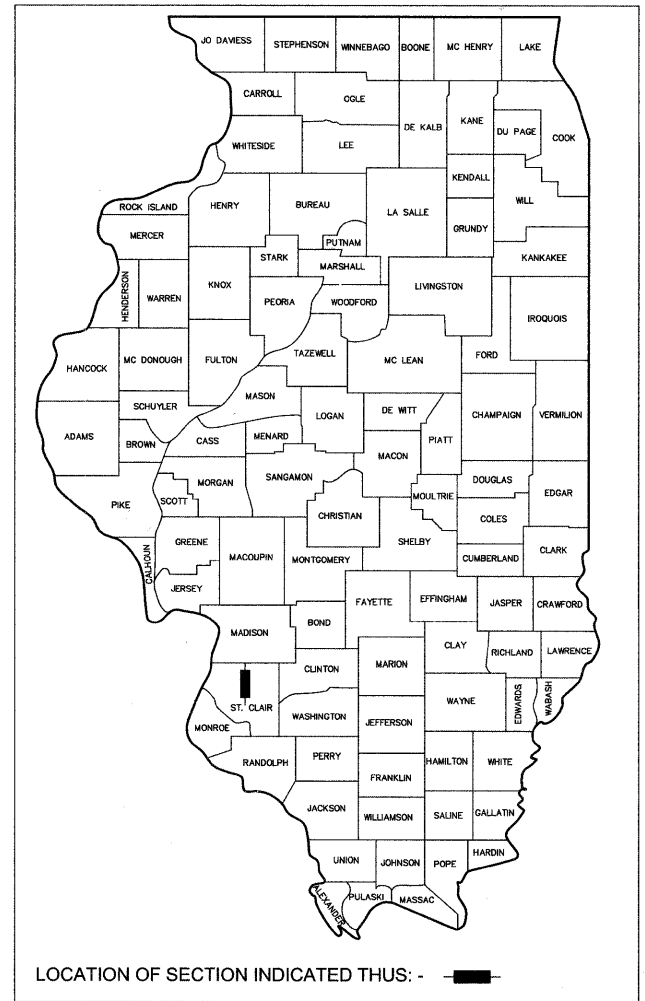
LOCATION OF SECTION INDICATED THUS: - [black rectangle] -

LENGTH OF PROJECT = 8,389 FT (1.59 MILES)