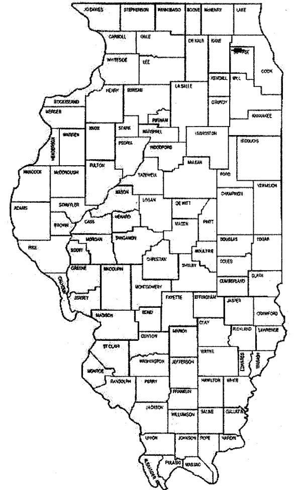
LOCATION OF INDICATED SECTION THIS: - - -