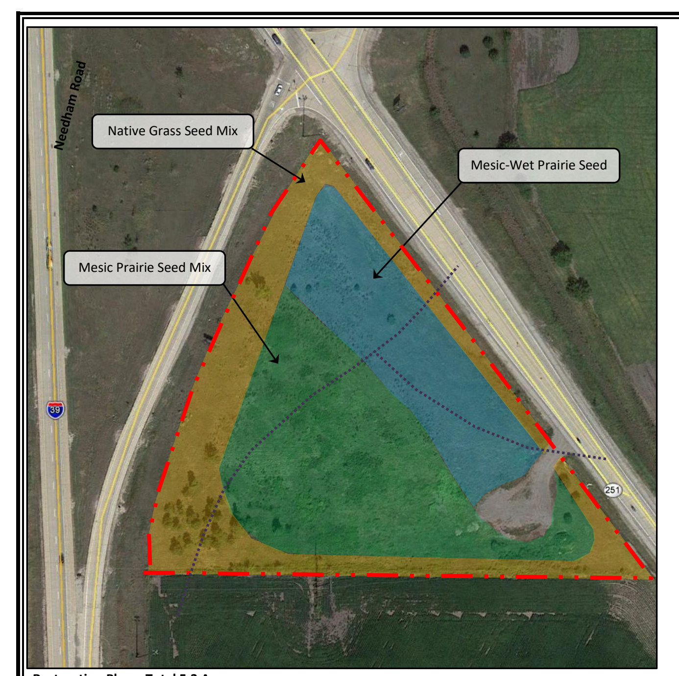
Restoration Plan – Total 5.3 Acres