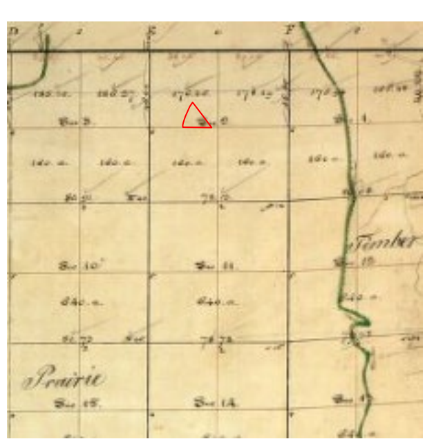
1800 Historic Vegetation Map