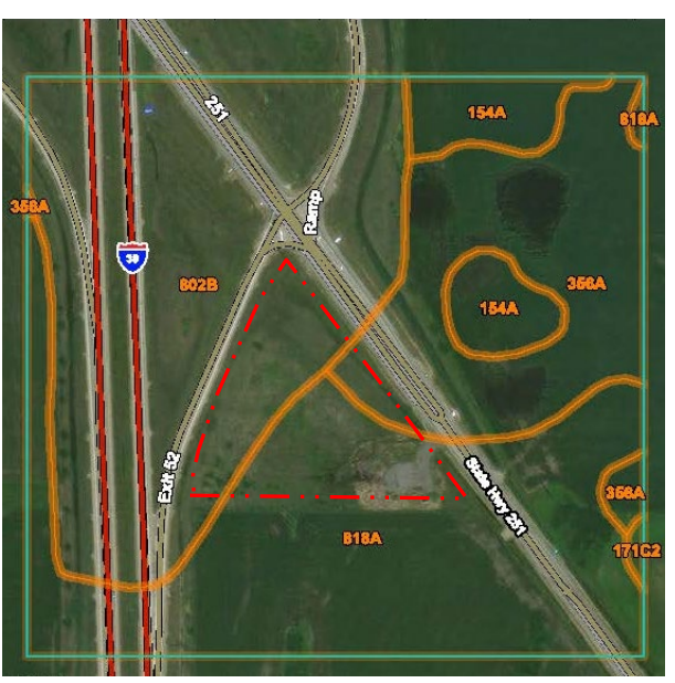
USGS Soil Map (Soil Description Table Below)