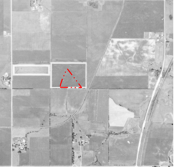
1939 Aerial Photo