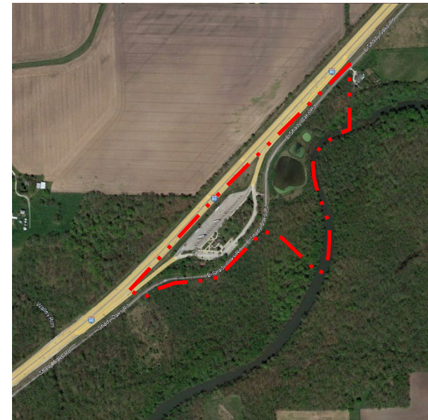
2015 Aerial Photo