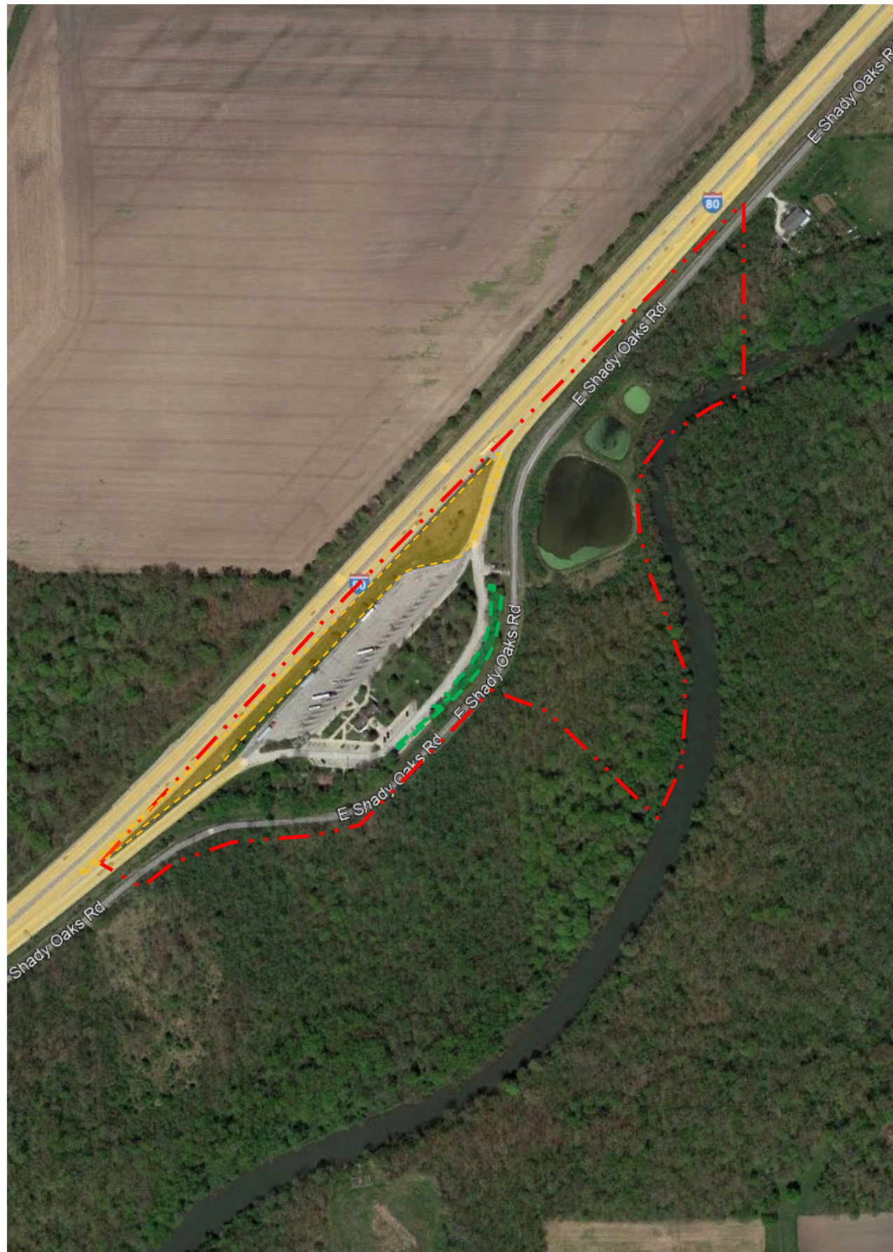
Site Plan – Total Site 3.0 Acres