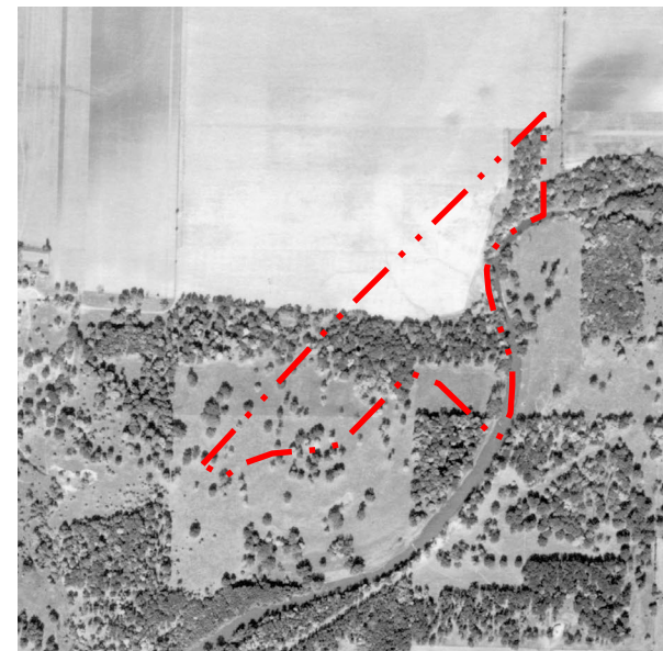
1941 Aerial Photo