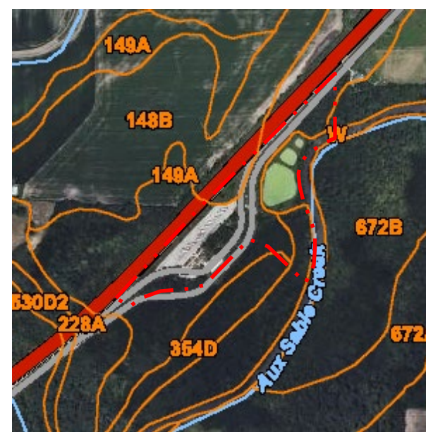
USGS Soil Map (Soil Description Table Below)