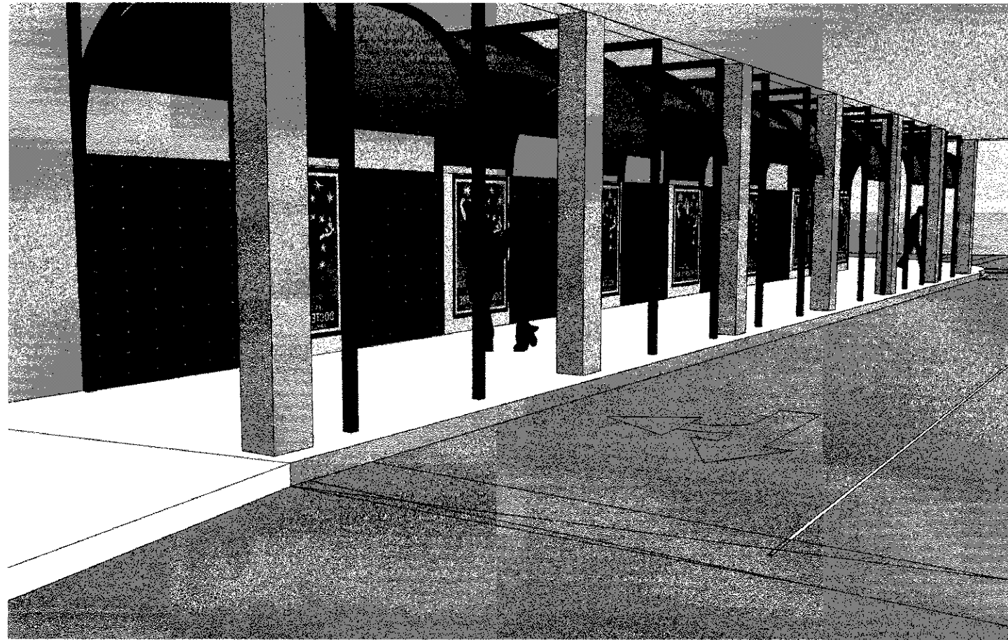
MARION STREET VIADUCT ARCHITECTURAL RENDERINGS OF ORNAMENTAL METAL PANELS (FOR INFORMATION ONLY)