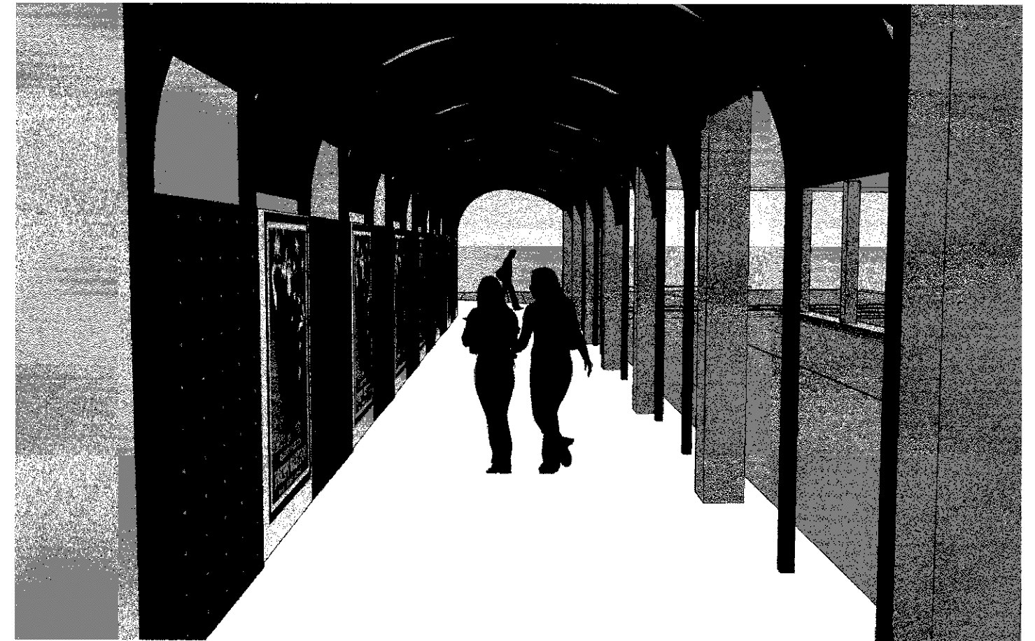
MARION STREET VIADUCT ARCHITECTURAL RENDERINGS OF ORNAMENTAL METAL PANELS (FOR INFORMATION ONLY)

FILE NAME = S:\JDI\6780-679\6784\812\Microa\CADD Sheets\JDI63722-ahf-Dist-05.dgn