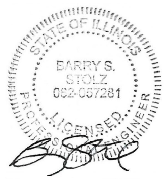
6/10/22 Exp. 11/30/23