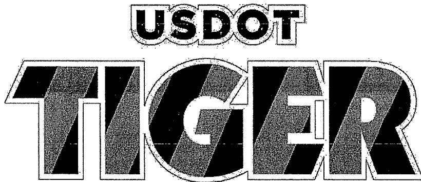
USDOT TIGER Vector-Based, Vinyl-Ready Pictograph

COLORS: OUTLINE - WHITE (RETROREFLECTIVE) USDOT LEGEND - BLACK TIGER DIAGONALS - BLACK, ORANGE (RETROREFLECTIVE)