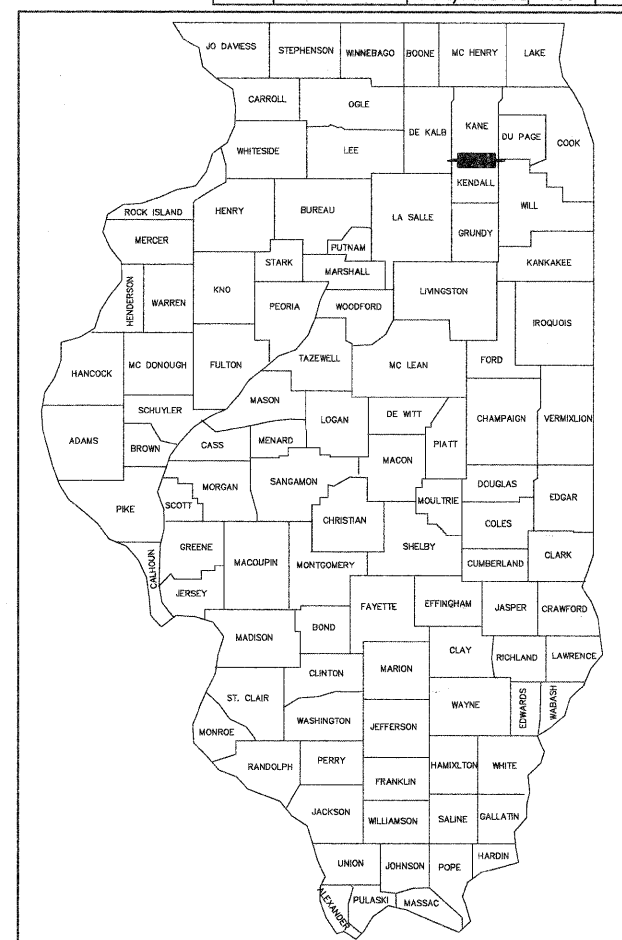
LOCATION OF SECTION INDICATED THUS: - ■■■ -