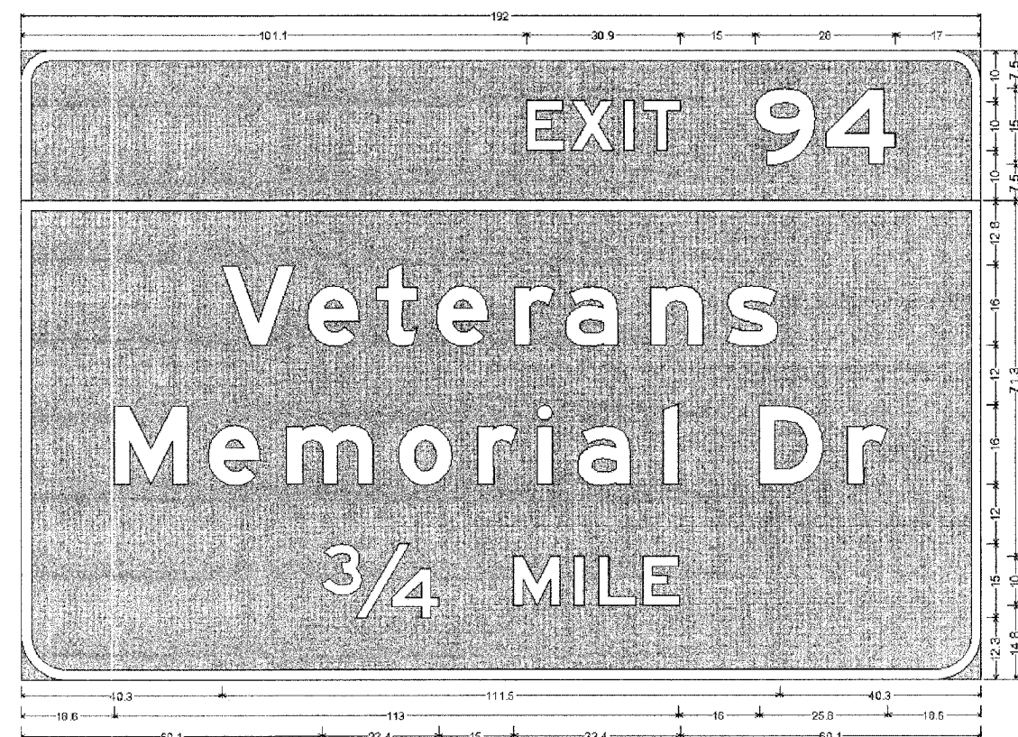
SIGN NO. 18 STA 789+15 LT \phi I57/I64 PLACE ON EXISTING TRUSS

6.0" Radius, 2.0" Border, White on Green; *EXIT* E Mod 2K; *94* E Mod 2K; 9.0" Radius, 2.0" Border, White on Green; *Veterans* E Mod 2K; *Memorial Dr* E Mod 2K; *3/4* E Mod 2K; *MILE* E Mod 2K; Table of letter and object lifts.