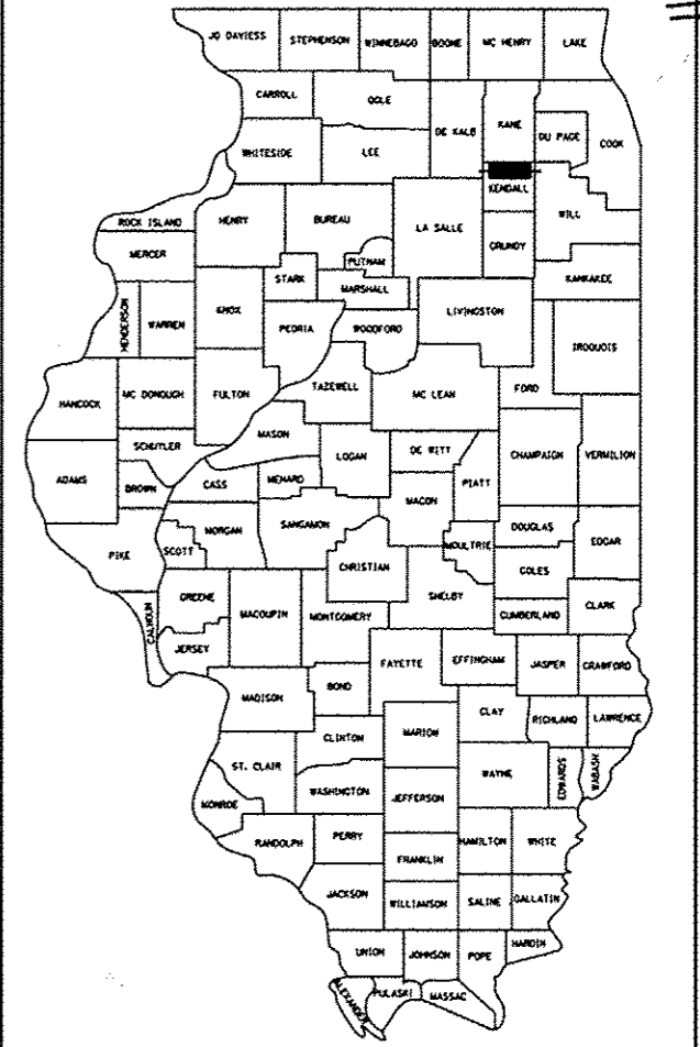
LOCATION OF SECTION INDICATED THIS: - [Black Box] -