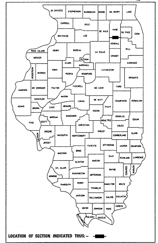
LOCATION OF SECTION INDICATED THUS: - [black box] -