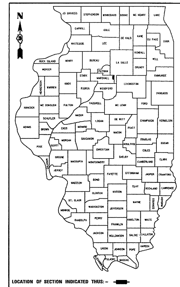
LOCATION OF SECTION INDICATED THIS: -