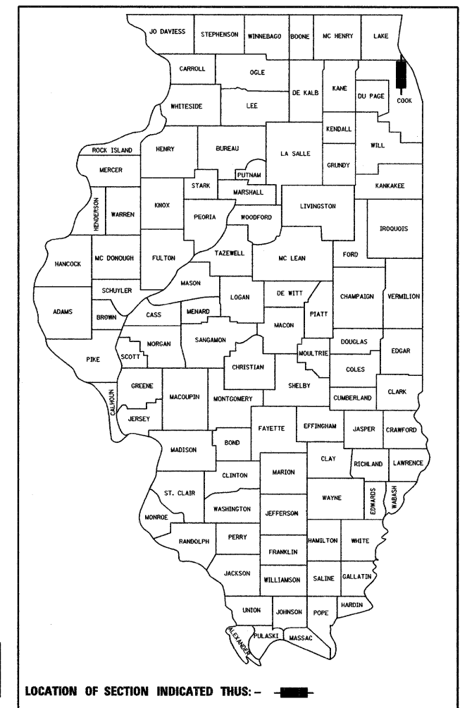
LOCATION OF SECTION INDICATED THIS: - [Symbol]